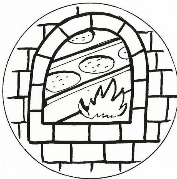
5. אפיה BAKING