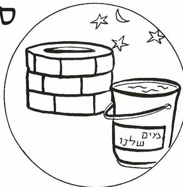
1. מים ש'לנו' WATER WHICH HAS STOOD OVER NIGHT